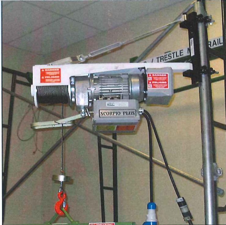
POST MOUNT: 60-53